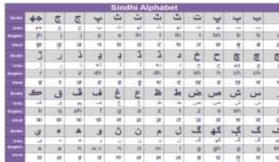
Figure1: Sindhi character set

Sindhi Language script has a total of 52 letters in its alphabet and its neighboring languages such as Persian (32), Urdu (39) and Pashto (44). Sindhi constitutes the largest extension of the original Arabic script. Sindhi starts from right to left for the characters, numbers, the system is from left to right Profitable OCR systems can mainly be gathered into two sorts: Task-specific readers and general-purpose page readers. A reader grips only exact document kinds [19]. Some of the most mutual task-specific readers read bank cheque, letter mail, or credit-card slips. These readers typically apply custom-made image-lift hardware that internments only a few predefined text regions. For example, a bank-cheque reader may test just the quantity field and a postal OCR system may test just the report block on a mail piece. Such systems underline high throughput charges and low error charges. General-purpose page readers are intended to grip a extreme variety of papers such as commercial letters, technical writings, and newspapers. These systems capture an image of a text page and distinct the page into script regions and non-text regions. Non-text regions such as graphics and line pictures are repeatedly saved distinctly from the text and connected recognition grades. Text regions are segmented into lines, words, and characters and the characters are conceded to the recognizer. [20]